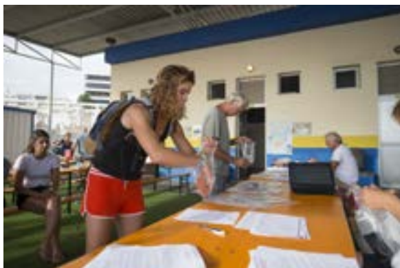
Mini ritual. Handing over phones upon signing in

To understand this Classe Mini choice, one must first understand how Minis sail.