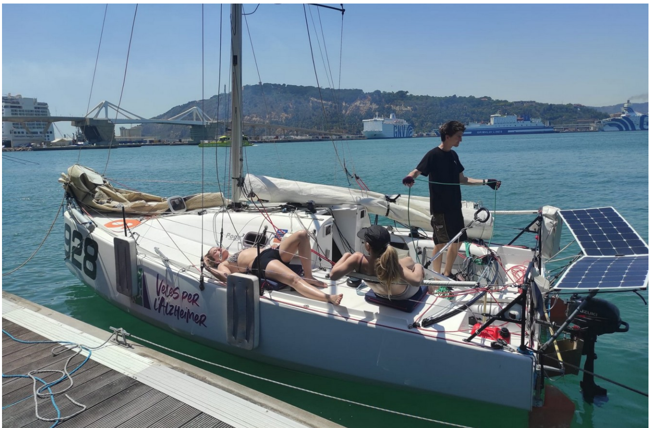
Girls love Suricate